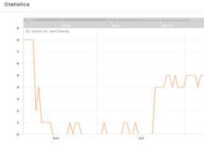
Fig. 5. Graphical record to bin level

The statistical representation can be viewed as: