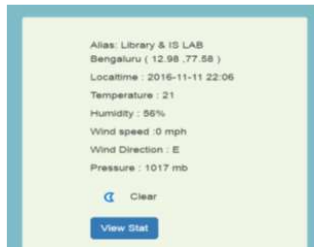
Fig. 4. Individual Bin Status

With an aim for future research work and learning, every individual bin were facilitated with their own recordings, as mentioned below: