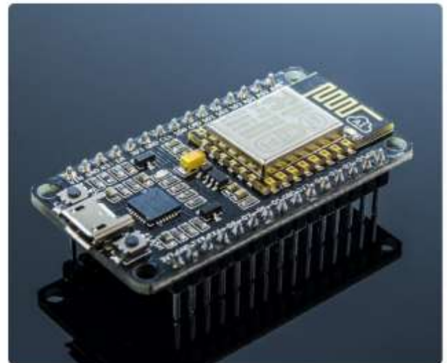
Fig. 2. A sample model of NodeMCU Unit

ESP8266 offers a complete and self-contained Wi-Fi networking solution, allowing it to either host the application or to offload all Wi-Fi networking functions from another application processor.