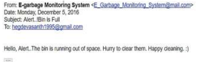
Fig. 7. Email notification regarding bin status

A separate email notification was also delivered as soon as the garbage bin reach cross a given threshold: