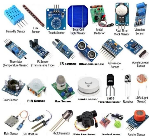
Fig. 3. Different types of sensors [14]