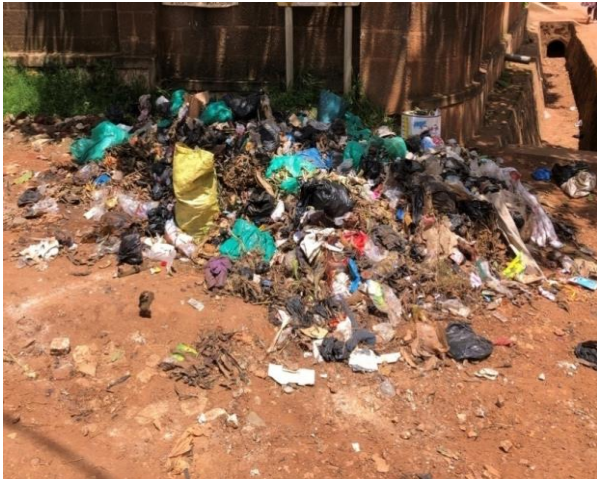
Figure 4: Unsorted plastic and biodegradable waste dumped by the roadside in Kyebando, Kampala.

Figure 5 below presents a summary of the obstacles to combating plastic pollution in Uganda, highlighted in this review paper.