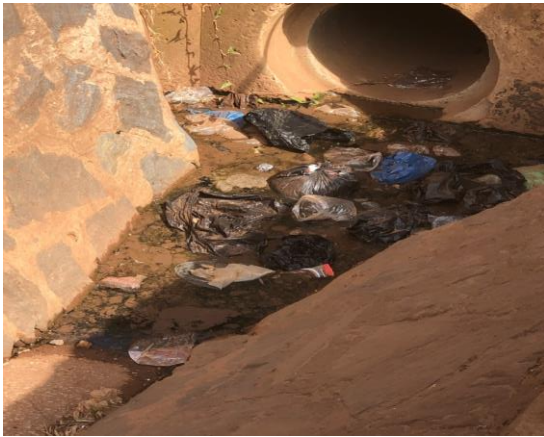
Figure 2: Plastic bags disposed into a drainage channel along Gaddafi road, Kampala.

A study by Balcom et al., (2022) identified several plastic disposal mechanisms in Uganda and these included open burning, dumping in landfill, burying, recycling, pyrolysis and incineration, Indiscriminate dumping long the road sides and drainage channels is also common in urban centers (Green watch 2023) as shown in Figure 2. Whereas open burning is the most commonly used disposal method for plastics, it is globally not recommended as it is a serious cause of air pollution which is accounts for over 1.2 million deaths in Africa annually. (Mebratu D, et al., 2022)