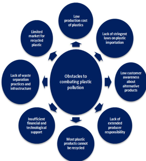
Figure 5: Summary of the obstacles to combating plastic pollution in Uganda.

Figure 5 below presents a summary of the obstacles to combating plastic pollution in Uganda, highlighted in this review paper.