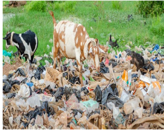
Figure 3: Animal grazing pasture littered with plastic (Green watch 2023)

Despite limited knowledge of plastic ingestion on human health, the harmful health effects of many additives used in plastic production are well documented. Additives like bisphenol A (BPA), phthalates, and plastic flame retardants contain substances that, with sufficient exposure, can cause birth defects and development disorders (WWF, 2019). Several reports also indicate that animals have died from feeding on plastic waste due to littering of animal pasture with plastic (green watch 2023) as shown in figure 3