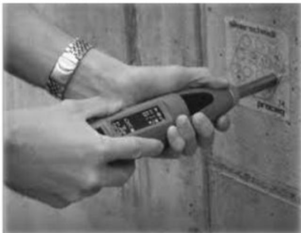
Figure 1: NDT of concrete by Schmidt Rebound Hammer

Non-destructive methods of surface hardness are non-invasive techniques that analyze substrate strength properties. Indication methods and rebound methods are two categories which describe concrete surface hardness techniques. These approaches aim to rely on observational associations between concrete strength characteristics and surface hardness as calculated by indentation and rebound. Originating in the 1930s, indentation techniques in the structural engineering industry are no longer popular although rebound methods are mostly used to analyze the basic strength properties, with reference to standard testing and interpretation guidelines [7]. The basic rebound hammer test is the most widely used surface hardness technique. The test was invented by Swiss engineer Ernst Schmidt in 1948 and is generally called the Schmidt Rebound Hammer [8].