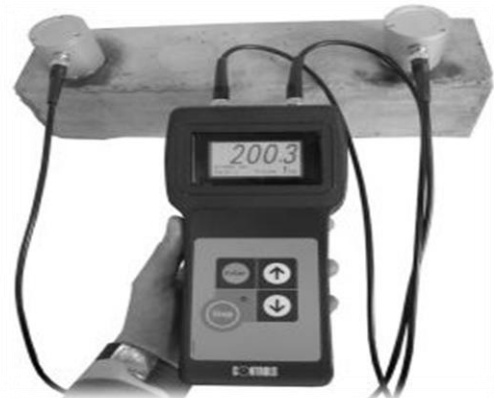
Figure 3: Ultrasonic pulse velocity test apparatus

Ultrasonic pulse velocity approaches include the spread of ultrasonic waves in solids as the wave time to travel between transmitting and receiving points is measured. Ultrasonic wave propagation features can be used to describe the composition, shape, elasticity, density and geometry of a substance using the similarities, existing patterns and mathematical relationships formed beforehand. This non-invasive technique is often used by studying the diffusion of ultrasonic waves to identify and define material defects and their degree of injury. Additional properties, cement forms, water cement levels, admixtures and age of concrete contribute to the variability of ultrasonic pulses as applied to concrete. [10] In addition, integrated pulse path strengthening may have an important impact on pulse velocity measurements (Concrete Institute of Australia, 2008). Taking these considerations into consideration during research, ultrasonic pulses are excellent ways to conveniently and cost-effectively investigate the uniformity and resilience of concrete.