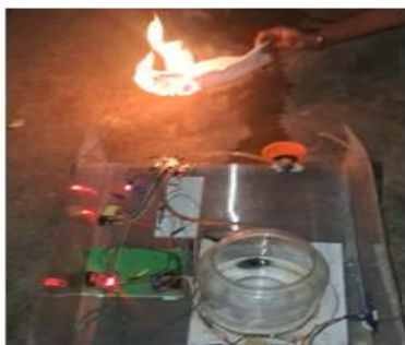
Fig-04: Fire Detection Output

The development and construction of a semi-automated fire-fighting robot focus on enhancing safety in industrial and residential environments by reducing human involvement in dangerous fire situations. The robot is built around a microcontroller that acts as the main control unit, receiving inputs from flame, temperature, and smoke sensors to detect fire and abnormal heat conditions. It is mounted on a sturdy chassis with DC motors and wheels, allowing smooth movement across different surfaces. A rechargeable battery supplies power to all electronic and mechanical components, while a motor driver controls the speed and direction of the robot. The system can operate in both automatic and manual modes, giving flexibility to the user.