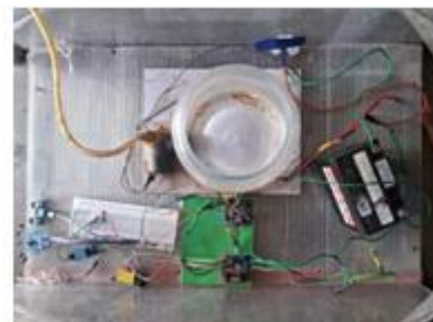
Fig-1: Robot's Schematic Picture

Design conceptualization of robot: The robot design involves the creation and assembly of a sturdy and highly maneuverable hardware chassis. For our prototype, we have opted to use a polycarbonate Sheet, which provides a solid foundation for the robot's structure. Please refer to Figure1 below for an illustration of the robot's design with the polycarbonate Sheet.