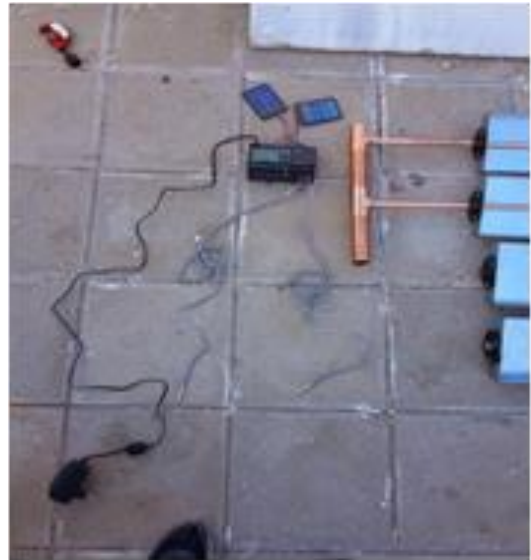
Fig.3. PLC installation

Sensors for heat, sunlight and changeover switches were connected to a programmable logic controller (PLC) for managing all input and output signals.