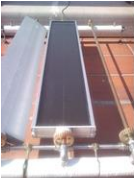
Fig.1. Solar collector

The water heating pipes were placed in a longer distance compared to conventional pipes and function as the rotating axis of the collectors. Photovoltaic cells were placed in the back of the collectors for electrical energy to be produced when the controller switches functions between solar water heater and photovoltaic panel.