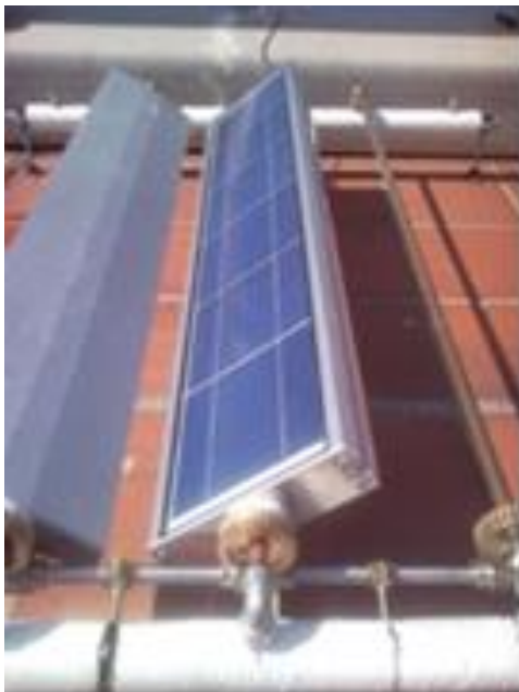
Fig.2. P/V rotary collector

The water heating pipes were placed in a longer distance compared to conventional pipes and function as the rotating axis of the collectors. Photovoltaic cells were placed in the back of the collectors for electrical energy to be produced when the controller switches functions between solar water heater and photovoltaic panel.