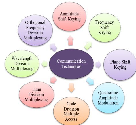
Figure 3: Optical communications technique

Hence, expanding the audience reach and enhancing the transmission capacity of optical networks are the goals of optical communications research and development. It is remarkable and noteworthy that coherent optical systems are already in operation. Though it made an appearance in the early 1980s, the idea "disappeared" when optical amplifiers were developed. Efficient data transfer is guaranteed by a number of communication mechanisms. Despite its simplicity, "Amplitude Shift Keying (ASK)" is susceptible to noise and signal distortion [14]. It represents digital data by varying the amplitude of the optical signal. In comparison to ASK, "Frequency Shift Keying (FSK)" offers superior noise resistance due to its usage of distinct frequencies for each binary state. The use of phase modulation in Phase Shift Keying (PSK) allows for more efficient data transmission over a wider spectrum, but it is also more vulnerable to phase aberrations [15]. Combining amplitude and phase modulation, "Quadrature Amplitude Modulation (QAM)" maps several bits to a single symbol, improving transmission speeds and spectral efficiency.