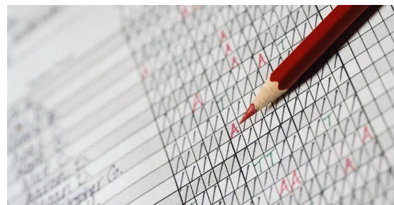
Fig 2: Manual attendance

students it will take away a lot of time and energy and also it will be a burden for the teachers and staffs. When attendance are taken manually there is always a chance of making some errors like marking absent to a wrong person or accidentally switching data or inconsistency in data, duplication in data.