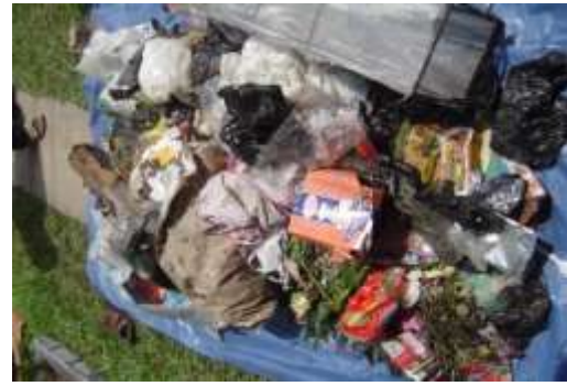
Fig. 1. solid waste samples at the research site

Several samples are taken at the work site in order to measure waste generation and composition according to SNI 19-3964-1994 [10], specifically dependent on the kind of house. 50 families that live close to the potential TPS3R building site were randomly selected to receive waste samples. The sampling of waste creation is done over the course of four days, with working days and weekends being the days that are chosen. This aims to determine the volume and weight trends of waste produced by locals close to the study site. According to the measurement results Table-1, an average individual produces 4.53 liters of organic waste per day, while an average person produces 2.52 liters of non-organic waste per day.