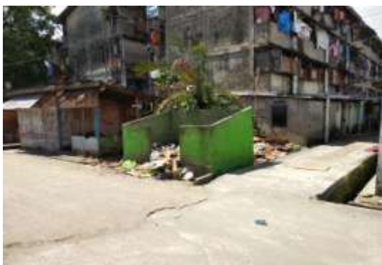
Fig. 2. Existing condition of waste collection in Sekanak

Fig.1. show the solid waste sampels, the most common type of waste is organic waste, which is composed of kitchen scraps or food waste on average to the extent of 67.27 percent, while non-organic waste, which is composed on average of 32.73 percent plastic waste (food wrappers, bottles, and glass), paper waste, and cloth waste, is produced in smaller amounts. Each household's trash collection is mixed together and has not been broken down by trash kind.