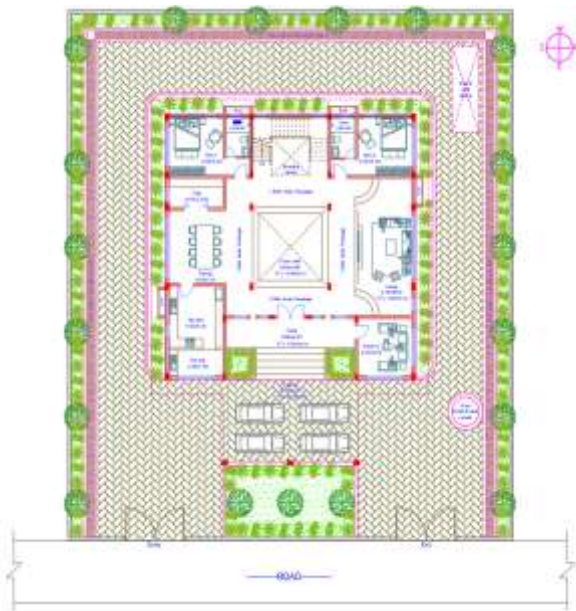
Fig. 1. Architecture 2D model