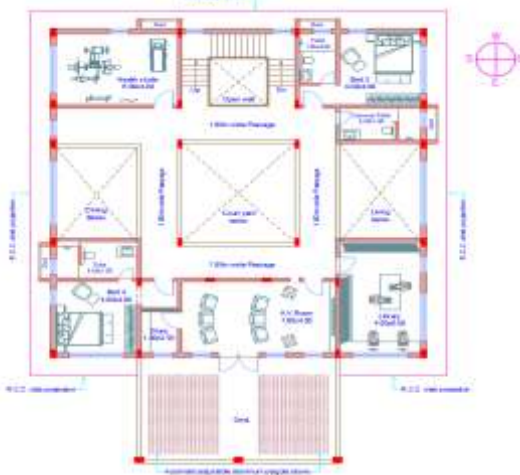
Fig 2 Staad Frame model