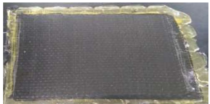
Fig.5. Hybrid composite of GA & GB