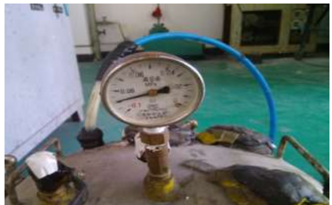
fig.4. Pump of RTM process