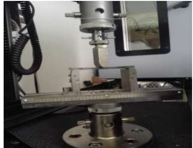
Fig.7 Loading of bending specimen