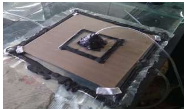
fig.3. RTM Process