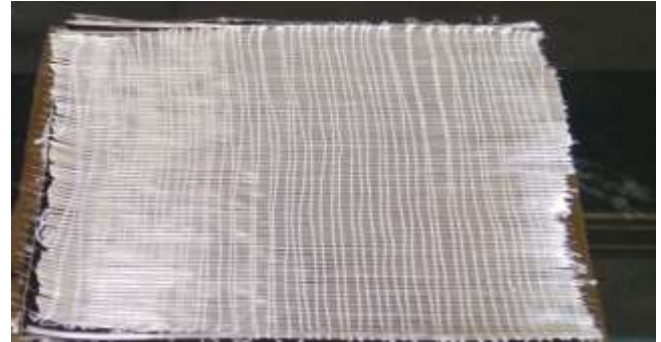
fig.2. Glass and Carbon in the flat mold