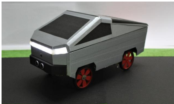
Fig 1: Ghost Car Prototype.