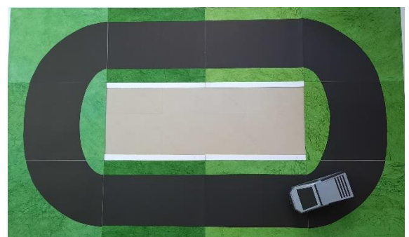
Fig 6: Track Model