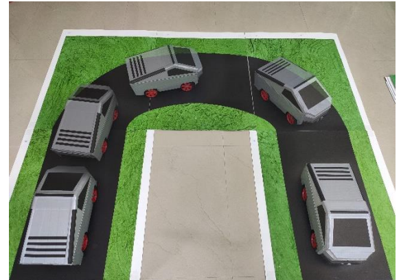
Fig 5: Prototype Turning at angle of 25° to right.

The model car was designed to perform forward and backward movement through rear-wheel-drive chassis design, along with front-wheel steering up to an angle of 25° on both left and right directions as shown in Fig 5. The track design was an oval track (as shown in Fig 6) which can be detached and rearranged to form different designs for testing and training the CNN model. The output from above 3 Sections was fed as input to the prototype's actuation code, which would then take an appropriate decision on the car's movement.