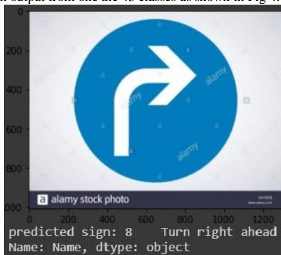
Fig 4: Traffic Sign Detection.

For Traffic Sign Detection, we used German Traffic Sign dataset which comprised of 43 different traffic signs, with each traffic sign having images of 32x32 pixel. Before passing these images as input to CNN training model, all the images were preprocessed. The preprocessing of images took place in 3 steps. Firstly, the image which would be in RGB colour space would be converted to Gray colour space. Secondly, then the histogram of the image would be equalized, this allows for areas of lower local contrast to gain higher global contrast. Thirdly, rescaling of the image would be done to transform every pixel value from range [0,255] to range [0,1], which will treat all images in the same manner and contribute evenly to the total loss. This preprocessed image is fed as input to the CNN training model which would predict an output from one the 43 classes as shown in Fig 4.