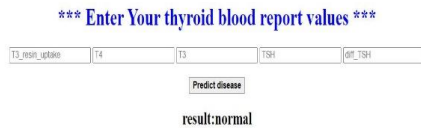
Fig 11: example result2