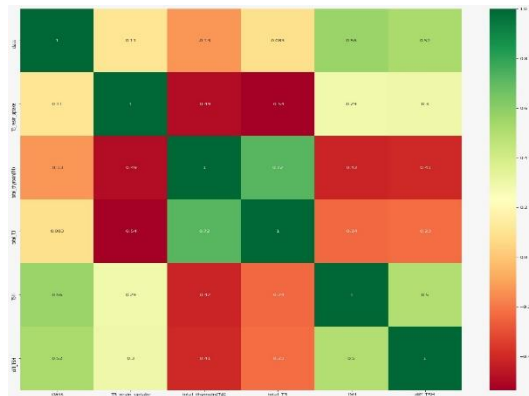
Fig 3: Heat Map

A heat map (or heatmap) is a data visualization technique that shows magnitude of a phenomenon as color in two dimensions. The variation in color may be by hue or intensity, giving obvious visual cues to the reader about how the phenomenon is clustered or varies over space. Correlation between parameters of our dataset is interpreted and pictorial view is obtained as shown in fig 3.