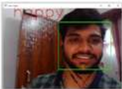
Fig 5. Happy Emotion

It's worth noting that the proposed method only misclassified a few photographs with perplexing perspectives, and overall identification accuracy remains impressive. As a result, the method suggested in this work holds promise in a real-world environment where non-frontal or angularly captured photos are the norm.