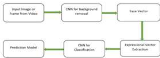
Fig 2: Emotion Detection Process

A. Convolutional Neural Network (CNN) Currently, CNN is one of the foremost mainstream approaches to deep learning techniques. It uses a variation of multilayer perceptron designed to want minimal pre-processing. It gets its name from the type of hidden layers it has. Convolutional layers, pooling layers, fully connected layers, and normalising layers are common components of a CNN's hidden layers. [2]