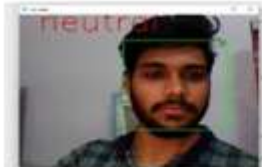
Fig 7. Neutral Emotion