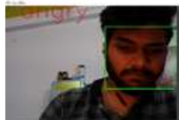
Fig 6. Angry Emotion