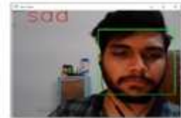
Fig 8. Sad Emotion

The output images of different images are show from figure number 5 to 8. When numerous faces were present in the same image and were at the same distance from the camera, the algorithm failed. It was discovered that when the number of photons increases, accuracy decreases due to over-fitting. Also, when the number of training photos is reduced, accuracy remains low. The ideal number of images was found to be in the range of 2000–11,000 for FER to work properly.