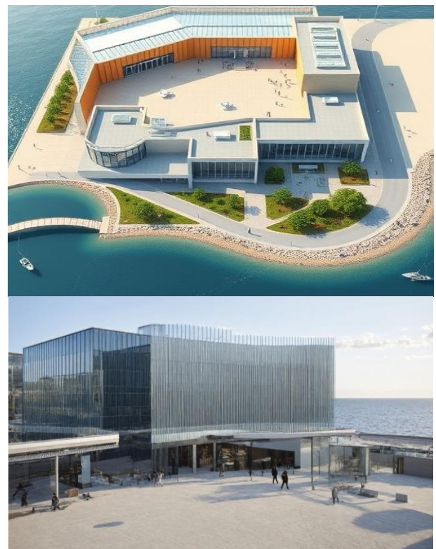
Fig. 3. A, B 3D concept of the marin museum in Sabratha city

The surrounding outdoor area features a scenic seaside walkway with interpretive signage and resting spots. An educational garden showcases native coastal flora and interactive exhibits related to marine ecosystems, offering an engaging outdoor learning experience.