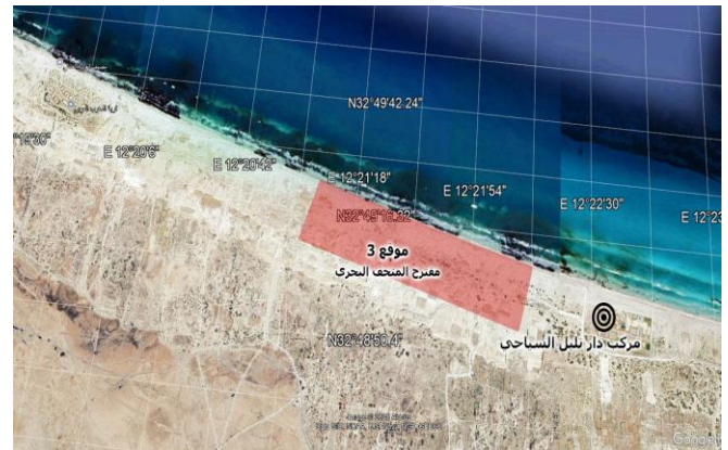
Fig. 1. Suggested location of the marine museum in Sabratha city

Located on Libya's western coast, Sabratha's strategic Mediterranean frontage and rich historical-cultural fabric provide a potent backdrop for a maritime museum. A preliminary site was identified on an accessible seafront area close to the city core and main transport routes, offering ample space for phased development and expansion.