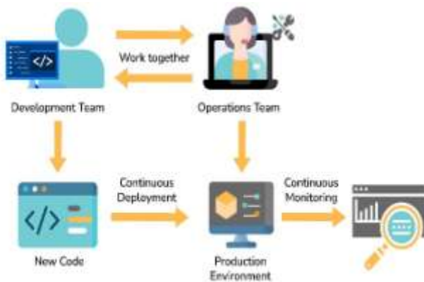
Figure – 1: The lifecycle of DevOps

For cloud-hosted apps and big distributed systems, DevOps architecture is employed. Agile Development is utilized in the DevOps architecture to provide seamless integration and delivery. For DevOps, both development and operations are required in order to provide applications. Analyzing requirements, designing, creating, and testing software components or frameworks are all part of the deployment process. When both Development and Operation are united to work collaboratively in a task, The architecture of DevOps comes into the picture (12). It is made up of several phases that collectively form the DevOps lifecycle. These are the primary components that guarantee DevOps optimizes all development processes, from proposal through production and delivery.