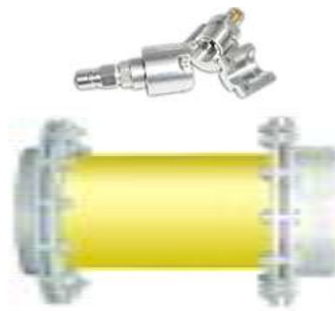
Fig:4 End Closures

An extensive range of End closures suitable for various diameters according to ASTM, ISO, DIN, EN and other standards.