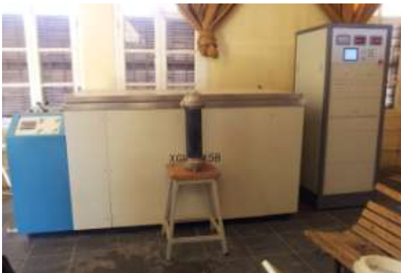
Fig:2 hydrostatic pressure tester