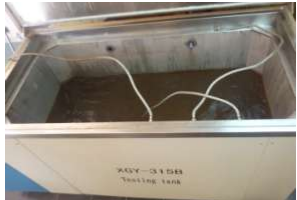
Fig: 3. Test tank for hydrostatic pressure tester