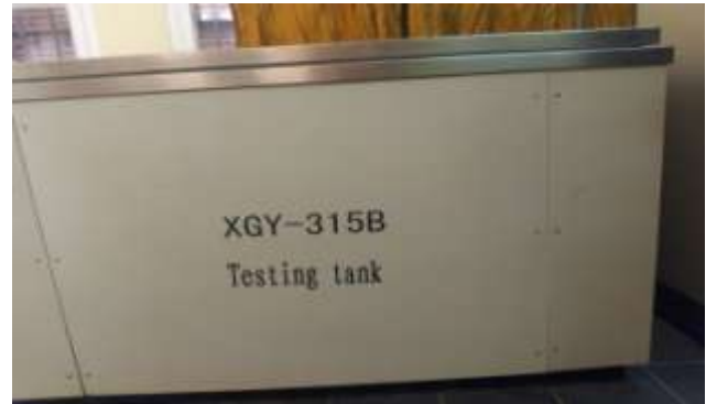
Fig: 3a Test tank for hydrostatic pressure tester

the interface of the test tank can be customized based on customer's requirements.