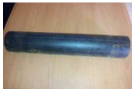
Fig:1 sample of test High density polyethylene pipe.

Material high density polyethylene, shape: Pipe Specimen, Length is 50mm; the nominal outside diameter of the Pipe is 110mm, pressure applied 6 bars.