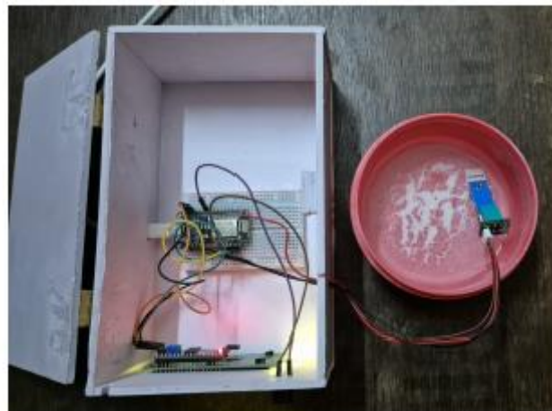
Fig. 1. NodeMCU8266 and SPE connector (Screen Printed Electrode connector) make up the model setup

This model setup consists of NodeMcu8266, screen printed electrode connector, screen printed electrode strip, LCD display, buzzer and test sample show in the Figure 1