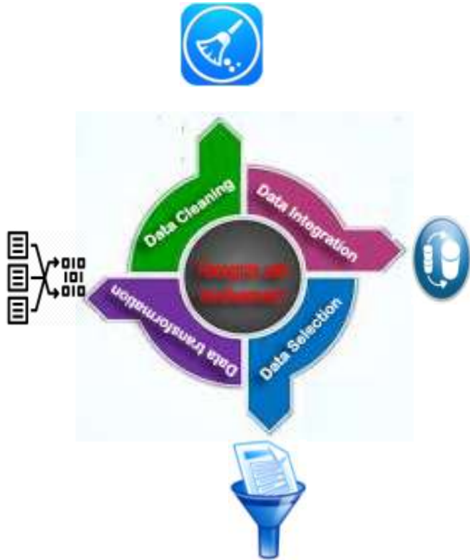
Fig 2. Recognize user involvement in learning experiences

The data mining techniques are applied to create and implement the model that summarizes the interest knowledge from the students log files.