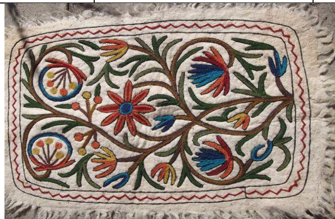
Fig. 9. Namda Felt Making Rug