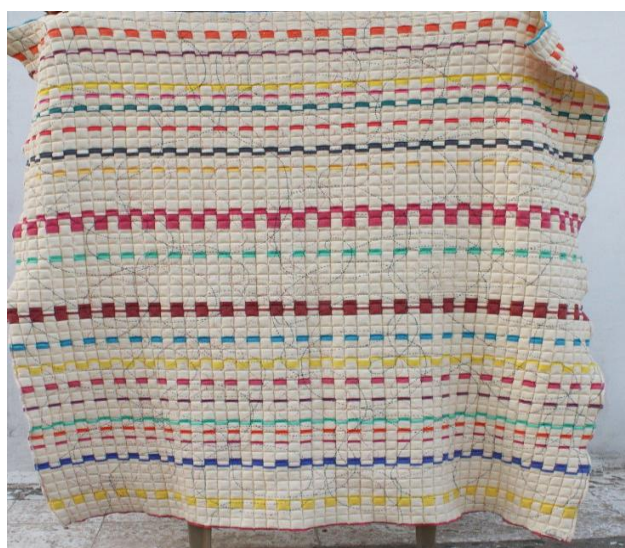
Fig. 3. Sujani Weaved Quilt