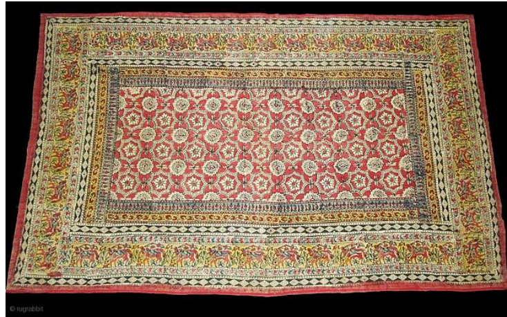
Fig. 6. Saudagiri Printed Rug