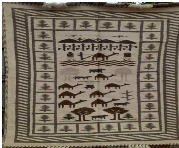
Fig. 2. Kharad woven rug