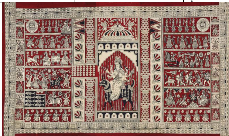
Fig. 7. Matani Pachhedi Painting