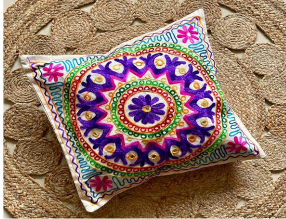
Fig. 8. Aari Emboidery Cusion Cover