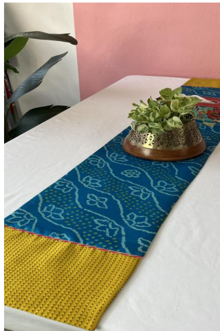
Fig. 4. Bandhani Table Runner