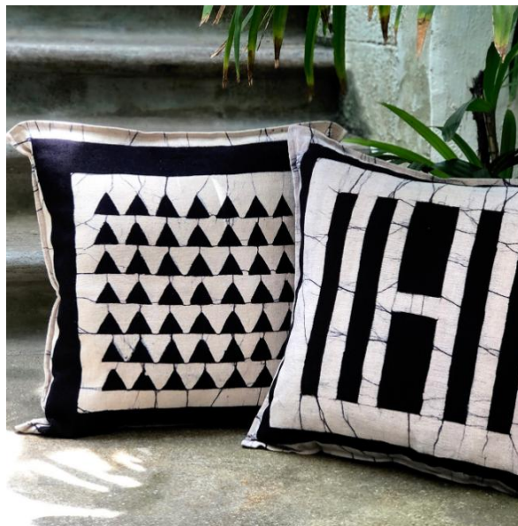
Fig. 5. Batik Cushion Covers