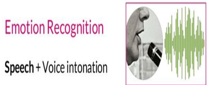
Fig.2. Speech Emotions

It was not astonishment that irritation was recognized as the most important sentiment for request hubs. Taking into explanation the position of anger and shortage of data for some other emotions we decided to generate a recognizer that can differentiate among two states: "agitation" which contains anger, happiness and panic, and "calm" which contains usual state and sorrow. To create the recognizer we used a corpus of 56 telephone mails of variable length (from 15 to 90 sec.) stating mostly normal and angry emotions that were logged through eighteen non-professional performers. These words were repeatedly split into 1-3 second chunks, which were then measured and branded by persons. They were used for making recognizers using the methodology developed in the first study [5]. The goal mouth of the expansion of this system was to create an emotion recognizer that can process telephone excellence speech memos (8 kHz/8 bit) and could be used as a slice of a result support system for prioritizing voice messages and assigning a proper agent to respond the message.