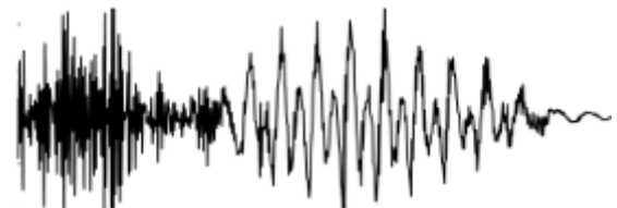
Fig. 3 Speech Signal (Time Domain)