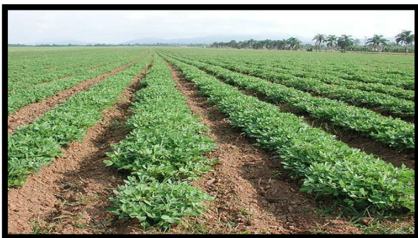
Fig 2. Groundnut Farm

Groundnuts grow great in mild, sandy loam soil with a pH of 5.7–6.3. Their ability to fix nitrogen and further develop soil richness. The crop cultivation land view is displayed in the figure 1. Accordingly, they are significant in crop revolutions. Additionally, the yield of the groundnut crop itself is expanded in no time, through diminished illnesses, weeds, and pests. Sufficient degrees of calcium, magnesium, phosphorus, potassium, and miniature supplements are likewise essential for great yields. If it is too soon, such a large number of pods will be unripe. As soon as the pods are too overdue, they snap off from the stalk and stay in the soil. For harvesting, the whole plant, including a large portion of the roots, is eliminated from the soil. The fruit products have badly crumpled shells that are choked between sets of the one to four seeds for each unit. Collecting happens in two phases: In automated frameworks, a machine is utilized to remove the principle foundation of the groundnut plant by slicing through the soil just beneath the level of the groundnut pod. This permits the grounds to dry gradually to somewhat less than 33% of their unique dampness level over a time of three to four days. Generally, peanuts were pulled and reversed manually.