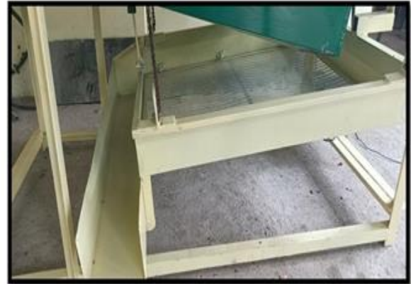
Fig.5 Fabricated view of separator

Separator is the displacement motion component which is used to collect the groundnuts and helps to remove soil stick to the pod of groundnuts. Separator is connected to eccentric mechanism and due to revolutionary stroke of eccentric it created up and down motion which is further helps to collect groundnuts.