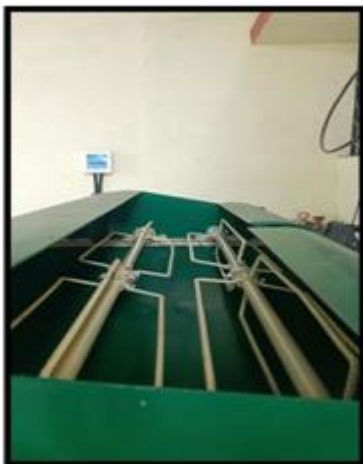
Fig.4 Fabricated view of rotor

It is the active or rotating portion of the machine. It consists of flanges which are made up of iron bars, which help to separate the pod from the plant. Two rotors are mounted on top of the table so that the two operators can perform their work. When the bunch of groundnut plants are fed to the rotor, it creates a shearing action and the pods get separated from the plant. As shown in fig. 4 four rotors are mounted on the shaft which rotates in opposite directions to each other.