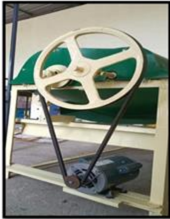
Fig.3 Transmitted power from motor to pulley

An electric powered motor is an electrical device which converts electrical energy into mechanical energy. Electric motors produce linear or rotary forces meant to propel some external mechanism, along with a rotor. The rotary motion of the rotor helps to separate groundnut pods from the plant. An electric motor is generally designed for continuous rotation over a significant distance compared to its size. A single phase 1 hp motor is used to transmit power from motor to pulley to rotate the rotor. The base frame of the motor is mounted on the table which is shown in fig 2 & 3.