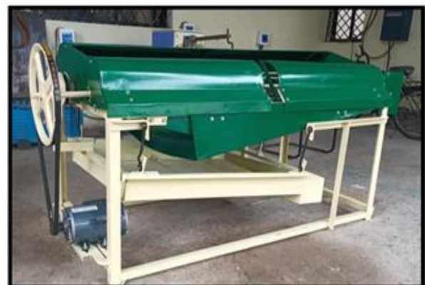
Fig.6 Fabricated view of the Machine

A single phase 1 HP electric motor is used to drive two rotor shafts through a belt pulley drive. The two rotating shafts mounted on bearings will get turned because of the belt pulley course of action. The whole assembly of bearings, shaft, rotor and separator are mounted on rigid support. L- Angles are welded around the periphery of rotors. The L-angles are so welded that they will not contribute to dynamic unbalancing. Henceforth, by considering dynamic adjusting rules, all L angles are welded. When the groundnuts in the plant are held against the side of the safety cover, which is projected outside the turning rotors, striking activity happens.