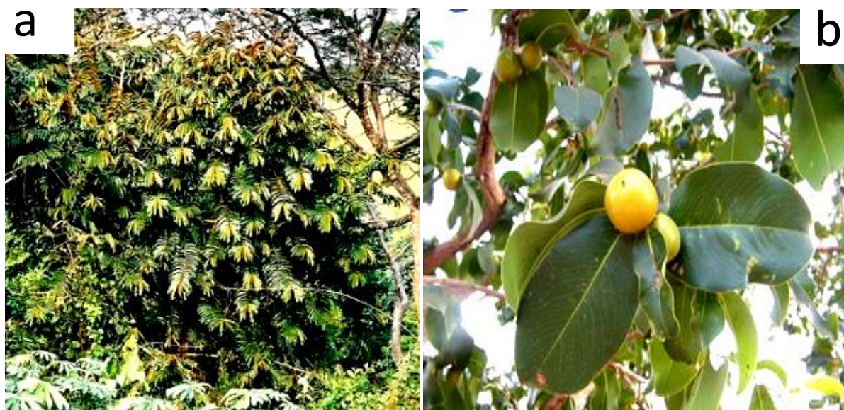
Plate 22: (a) Pycnanthus angolensis (Welw.) Warb;