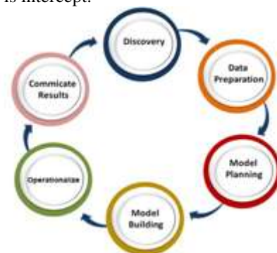
Figure 2: Phases of data science life cycle

where y is dependent variable, x is independent variable, m is slope and c is intercept.