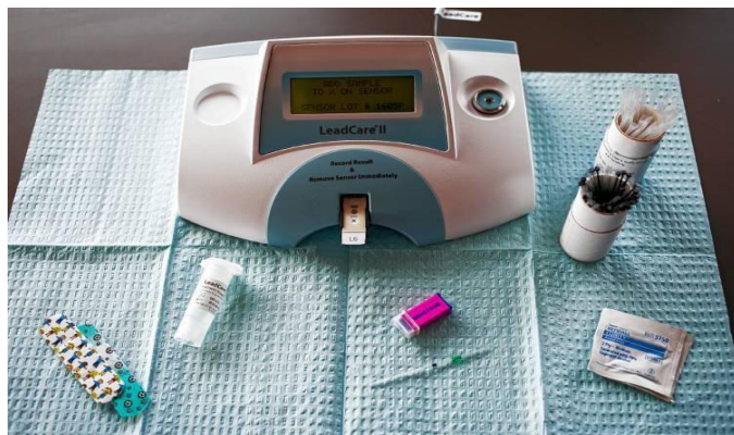
Fig. 1. LeadCare II-Blood Lead Analyzer.

Blood lead levels were determined by "LeadCare II-Blood Lead Test System" (Figure 1). This test is considered to be appropriate for field studies due to its cost-effective, easy-to-apply, portable features, and reliable method (Pineau et al., 2002). Samples were collected by using disposable injectors. 50 \mu l of blood samples were drawn from each worker by using capillary tubes and then transferred into vacuum blood tubes containing ethylenediaminetetraacetic acid (EDTA). The samples were mixed by gently rocking the tubes. The tubes were left to stand upright for a minute. The prepared samples were deposited onto electrode strips and then inserted into the analyzer. Within three minutes, the results appeared on the screen in \mu g/dl. The results were analyzed statistically by using the unpaired student's t-test to compare blood lead levels between worker groups and control group. The correlation coefficient (r) was used to determine the relationship between the blood lead levels and the ages or duration of exposure between worker groups.