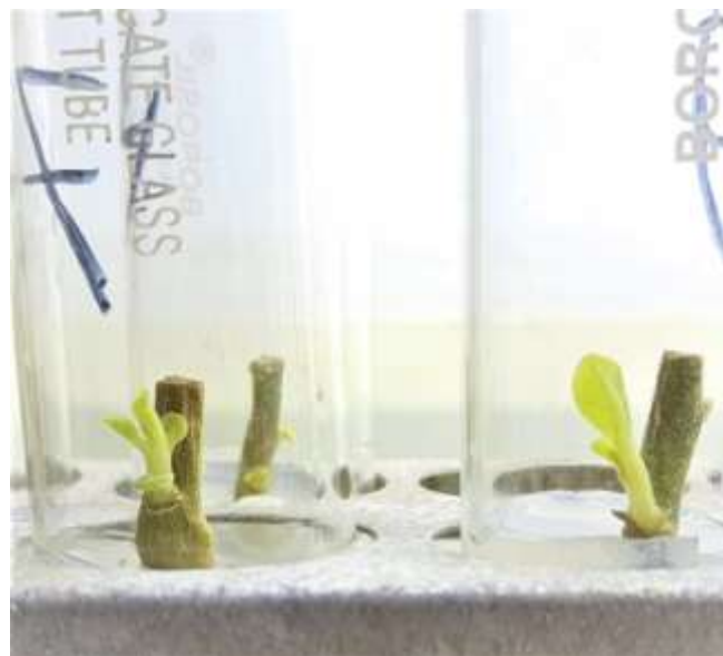
Fig 5. Shoot induction from nodal segment of Withania somnifera in MS media after 2 weeks.