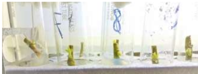
Fig 4. Growth of nodal segment of Withania somnifera in MS media with different concentration of BAP, IBA and NAA after 2 weeks.