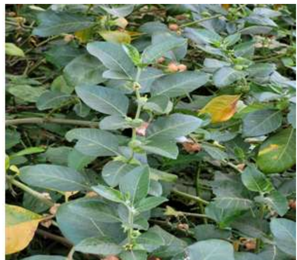
Fig 2. Image of Ashwagandha Plant.