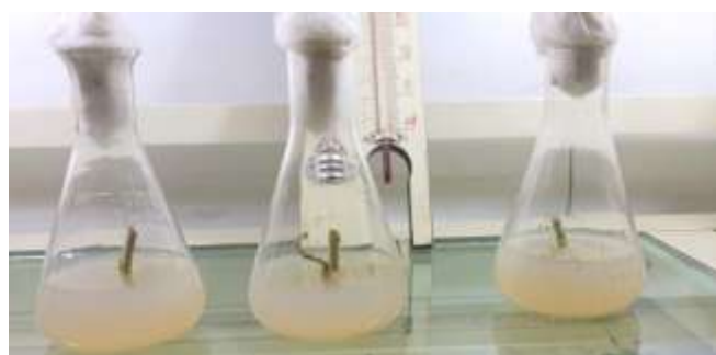
Fig 3. Culture of stem nodal segment of Withania somnifera .