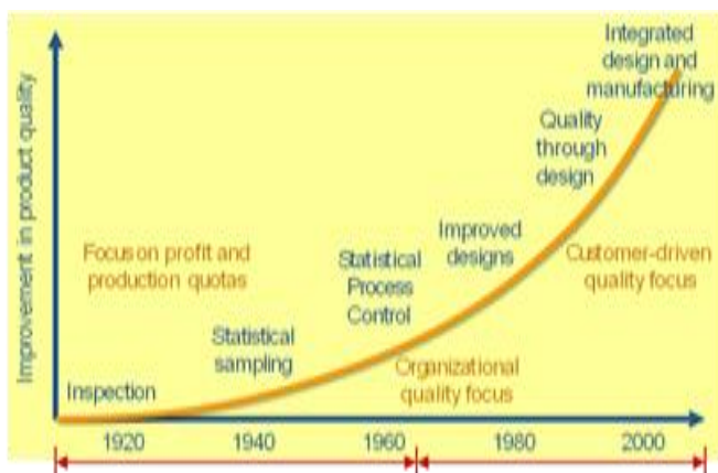
Fig.2 Manufacturing quality Management principles evolution

The following section briefly traces the Birth of Quality Management Principles in manufacturing quality. This is illustrated in Fig-2.