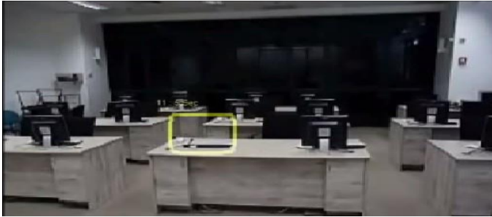
Fig. 5: Object Detection