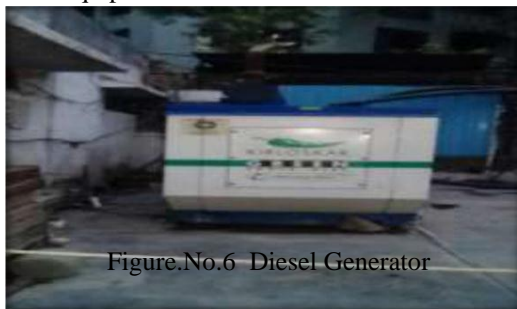
Figure.No.6 Diesel Generator

This is the machine which is used as a backup in case of cutoff of light supply, but in case if the Diesel Generator is not working the most labor on site will be idle and the work will be stopped.