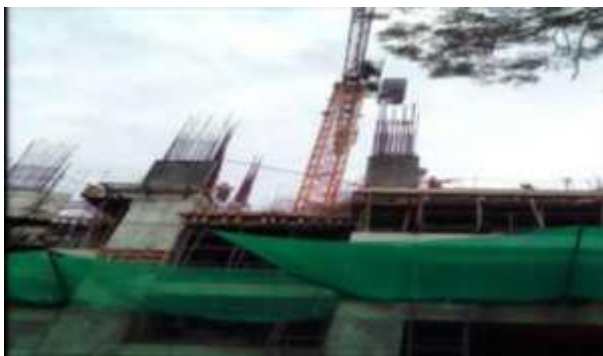
Figure.No.1 Mega Crane

Concreting by Mega Crane of the most efficient task, the efficiency depends upon the structure concreting to be done. For a structure like column, the tower crane can lift about 10 cu.m of concrete per hour.