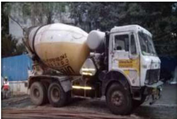
Figure.No.4. Transit Mixer 4.4.1