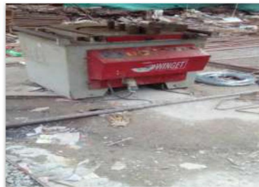
Figure.No.2 Bar Bending Machine