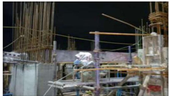
Figure.No. 5 Vibrator Needle

Vibrator needle is used for compaction of concrete at the time of casting. If the vibrator needle is breakdown at the time of casting, the concrete is not well compacted and the honeycomb occurs after deshuttering of structure. If the honeycomb occurs it is to be rectified with chemical mortar and in case of major honeycombing in column the structure is to be broken.