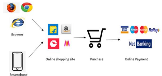
Fig. 1. Working of Online Shopping

Predicting the purchase intention of the buyers is quite challenging because there will be no individual conversation between the vendor and the buyer [3]. To improve marketing and sales, understanding the customer's behavior and providing relevant suggestions is much more important. These product recommendations can be done efficiently by examining the purchase history of each customer as well as the database containing the action of each customer while using the site.