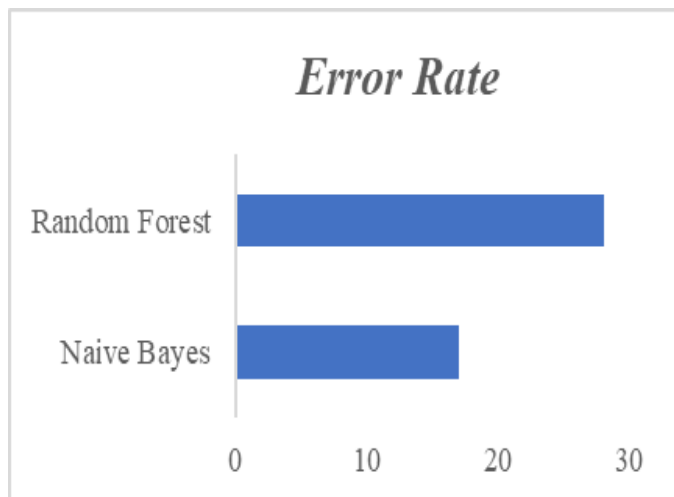
Fig. 5. Error rate