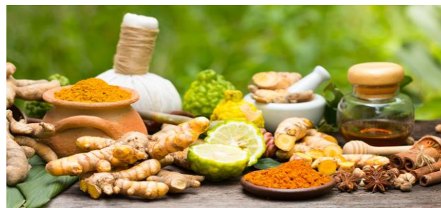
Fig. 1. Different herbs used