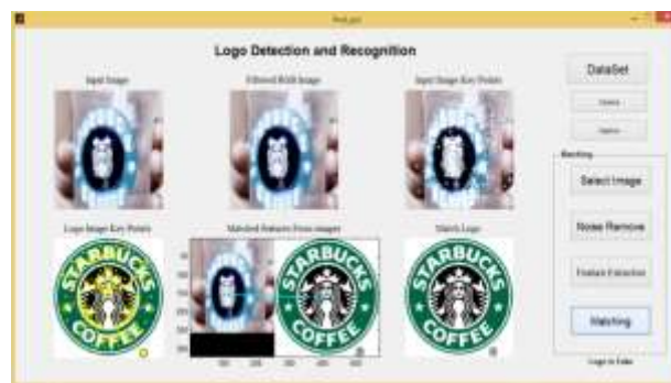
Figure 3: GUI for logo detection and recognition of starbucks coffee logo is fake.