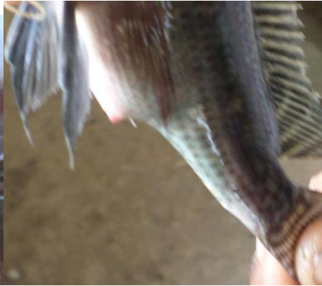
Figure 4: Abnormal growth