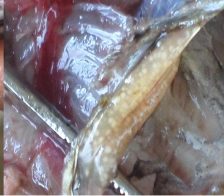
Figure 2: abnormal ovaries