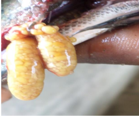
Figure 1: enlarged ovaries

The presents figure represent the resulting degree of gonad differentiation observed and recorded for sexually mature tilapia that received various experimental diets. Figure1 and 2 represent a comparison of normal and abnormal gonad differentiation observed in sexually tilapia that received various experimental diets over a period of 4months