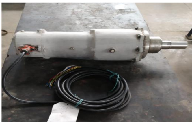
Figure 2 Assembly of Motor and Gearbox

An assembly line is a production procedure where different component parts (usually interchangeable parts) are added on this line as the semi-finished component parts, which is moved from working station to a station of assembling these parts in a particular sequence till the final product manufactured. By taking the com-opponent parts mechanically to the place of assembly work and moving the semi-finished assembly from work station to assembly station, a well prepared product can be assembled quickly and that too with less labor than by having workers to carry the stationary piece for assembly..