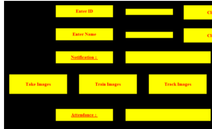
Fig 1.1 System's Dashboard

And in this system we can use also library for run a program. Library used are face-api.js, Tensorflow.js and face landmark recognition web Api is used for fetching facial detection.