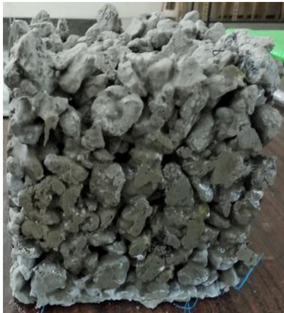
CUBE 1:8 Proportion