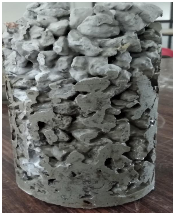
CYLINDER 1:8 Proportion