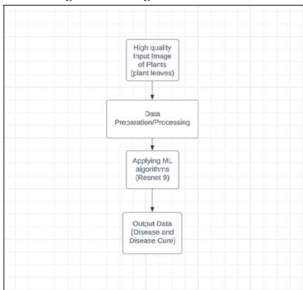
Figure: Working of Resnet9