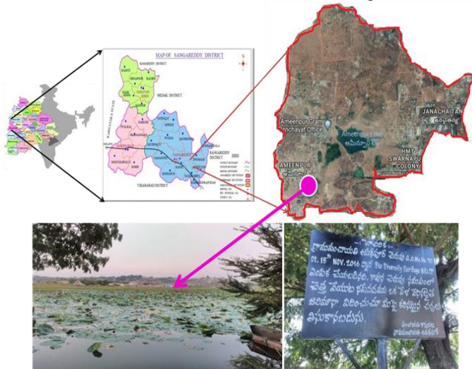
Fig. 1.1 Location of the Study Area

Bandam Kunta lake is selected as Biodiversity Heritage site under G.O.Ms.No.70 on 15-11-2016 from Telangana state.