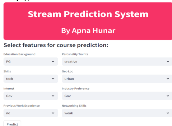
Fig 3 : Result page