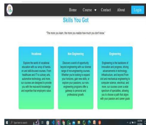
Fig 2 : skill you got

For each and every types of people can get help via using this application