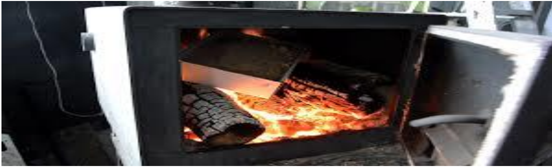
Fig(2):Saw dust ash

effectively use to avoid the environmental hazards. It used in a cement production which possess environmental friendly feature.