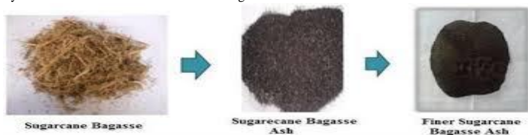
Fig(1): Bagasse Ash

Bagasse Ash is obtained by burning the bagasse of sugar cane after exerting sugar juice from it. India is largest manufacturer of sugar cane in the world and produces 300 million tone per year. To avoid the excess generation of waste and to use it effectively in economical way bagasse ash is used fuel, Raw bagasse ash has a large practical size and a high porosity so it contain more water contain in a concrete mix.