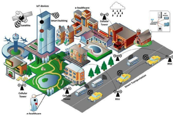
Fig: An assumption of IOT model

In the world various countries make IOT based smart cities and give an advance level of smart city vision as shown in fig [7].