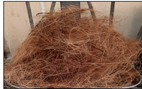
Fig.1: Coir fibre

The objective of using coir fibre (Fig.1) is to reinforce the concrete with natural fibre. Mostly in concrete project steel fibre and synthetic fibre are used but the reason for using natural fibre is because it's highly polar due to high polysaccharide content and also its easier availability in nature. The physical properties of coir fibre like