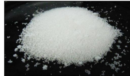
Fig.3: Sodium Hydroxide (NaOH)

composites after alkali treatment. He told that among all the methods alkali treatment may be considered to be economical processes for increasing adhesive properties of coir fibre. for a detailed study on alkali treatment more, literature papers were studied like Libo yan et.al. (2016) investigated the effect of alkali treatment on coir fibre for reinforced cementitious composites. They concluded that the effect of coir fibre treatment with 5 wt.% NaOH solution at 20 c for 30min shows better mechanical properties than plain hardening concrete.