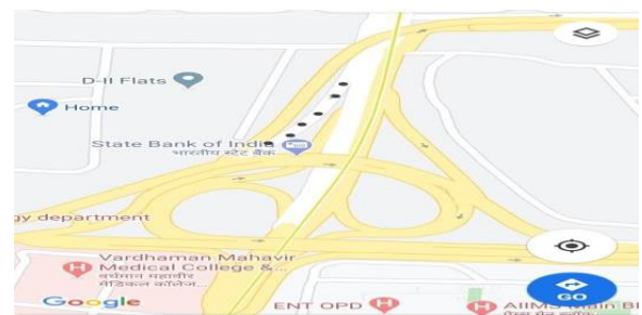
Fig1:Location of Project

Mahatma Gandhi Road (Inner Ring Road) in front of Dilli haat, INA, New Delhi of stretch 750m. It is a 2 lane road. The stretch is shown by black dots in the figure