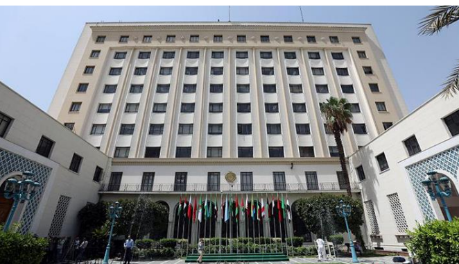
Fig. 3. The Arab League Headquarters' main entrance, the author

The City Centre and the historic Cairo were considered antiquities from a decaying past, thus were treated as touristic site seeing. Since Cairo Down Town was seen as a colonial symbol, it was neglected by the Nasser regime. Few urban interventions took place during the Nasser era, but some old regime's projects were completed. One of Nasser's urban