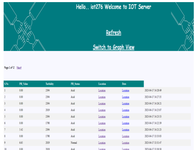
Fig 3 Water quality parameters at different locations from webpage

The parameters like pH and Turbidity values of water body along with its location and date is obtained in the webpage. The fig 3 shows water quality parameters like turbidity value, pH value and pH status (acidic, basic and neutral) of different water samples at different locations along with date and time of measured parameters, the data will be updated for every regular interval of time through wi-fi module and stored in the cloud server. These values can be viewed by the authorities and the users anytime. With the help of these monitored values we can know the quality of water and further we can decide whether the water is suitable for drinking purpose.