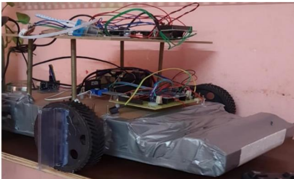
Fig 4 Hardware prototype of the proposed system

The fig 4 represents the hardware model of the proposed system. The data collected by this prototype is shown on the LCD and on the webpage.