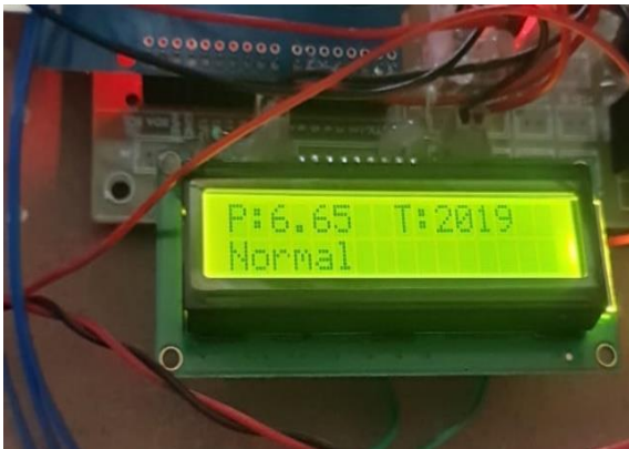
Fig 5 Output on the LCD

The Fig 5 represents the output which is displayed on the LCD consists of pH, turbidity values along with its pH status. Here, it is shown that pH value and the turbidity value of the water sample is 6.65 and 2019 units respectively. The pH and turbidity values are within the