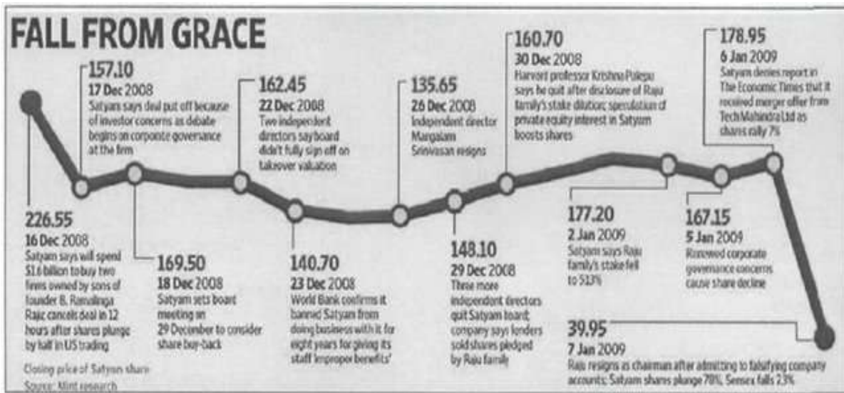
Figure 2: Satyam stock decline between December 2008 and January 2009

graph “Fall from Grace,” shown in figure:2 depicts the Satyam’s stock decline between December 2008 and January 2009.