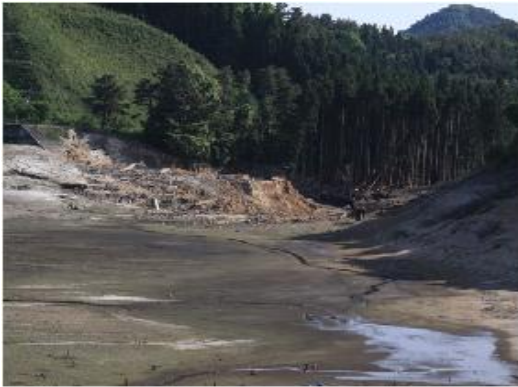
Fig.2 Dam failure at Fujinuma

water reservoir that in used for irrigation purpose [JCOLD, 2011]. The embankment dam started to fail after the earthquake occurred and completely destroyed during 20 minutes. Before the earthquake occurrence, the dam reservoir was full. The bank of 18 m height and 133m length failed just after earthquake occurrence. The dam was not designed under consideration of seismic forces.