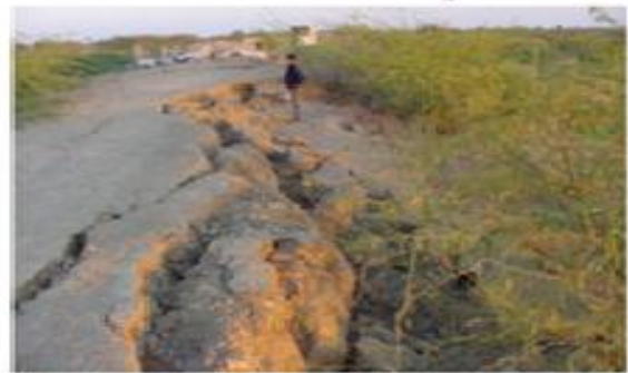
Embankment Failure - Bhuj Earthquake, 2001

Another dam Fatehgadh Dam, constructed in 1979, is an earth dam with a maximum height of 11.6 m and crest length of 4050 m and the Fatehgadh Reservoir was nearly empty during Bhuj Earthquake. However, the alluvium soils underneath the upstream portion of the dam was saturated at that time. Bhuj Earthquake triggered failure near the bottom portion of upstream slope (EERI 2001) possibly because of localized liquefaction near the upstream toe of the dam. The EERI (2001) also found cracks as deep as 1.5 to 1.7 m within the upstream portion of the dam and instability near the top portion of the downstream slope following the earthquake. The problem of appearance of longitudinal cracks may indirectly relate to liquefaction of foundation soils.