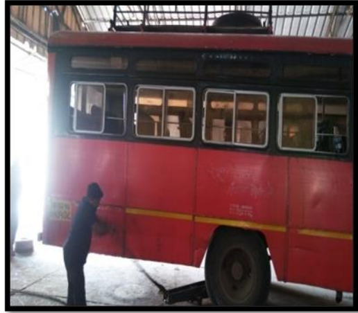
Fig. 3. Missing gloves

We observed a lot of safety related issues in the bus depot. We found that the electric wires attach to the battery were lying on the floor and electrical appliances were open which may cause electric shock and may lead to fire. Second thing we observed that the fire extinguisher was been expired, since many years it has not been refilled or replaced with the new one. The fire extinguisher was been damaged, rusted, depressurized and had loosed its ability to operate properly. Another thing we observed that the worker working in depot was been injured due to cutting tool which was lying on the floor and also safety shoes, goggles, apron, safety gloves were missing during working hours which may cause major damage to health and floor was slippery.