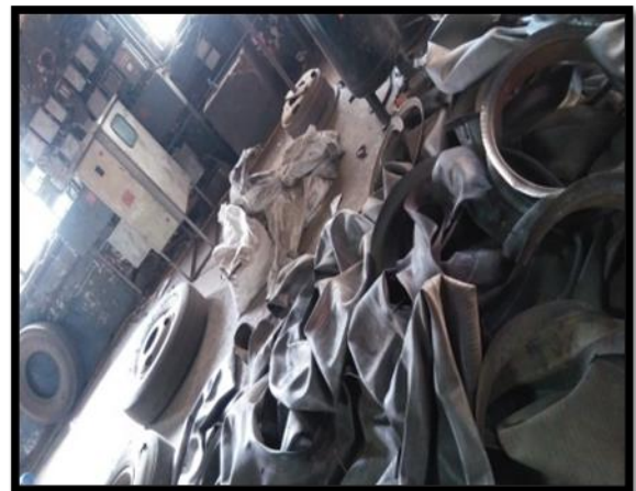
Fig. 4. Uncertain condition of tyre