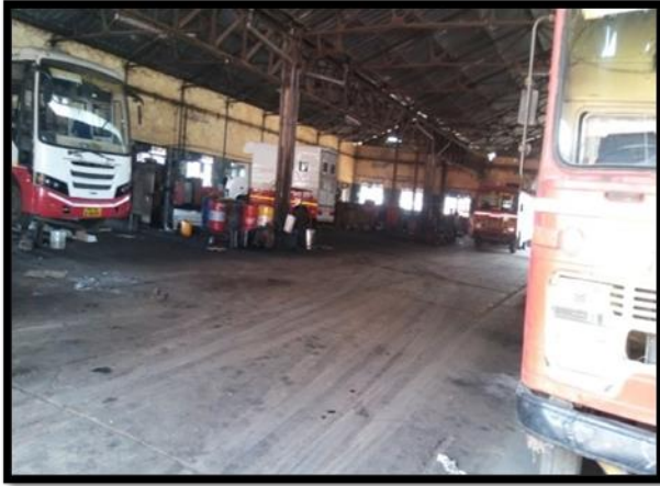
Fig. 9. Clean floor