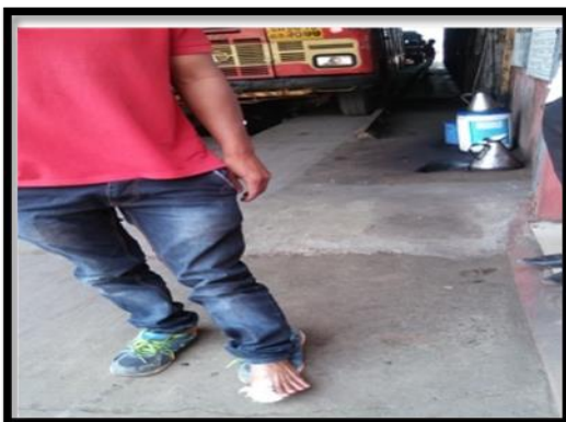
Fig. 2. Injury to worker