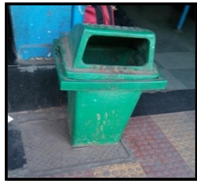
Fig. 13. Dustbin placed for garbage disposal