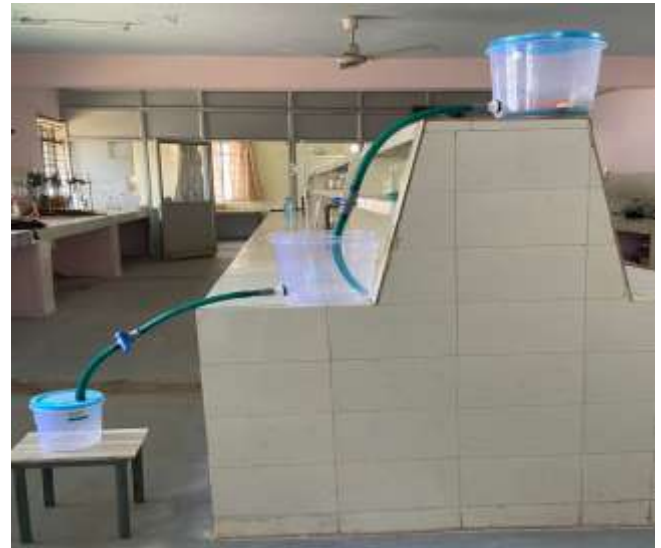
Fig. 1. Systematic Arrangement of Experimental setup