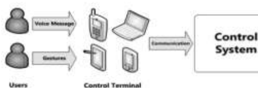
Fig 1. Model of Home Automation

The circuit consists of arduino mega 2560 board for comparing the input string received through Bluetooth with the stored string to give output to digital pin 6 of board to control the relay. Bluetooth module HC-05 transmits and also receives data serially via arduino board. A relay is used here to control only one appliance though you can use a multichannel relay board to control multiple appliances. Mega 2560 has 54 digital pins, each of which can be used to control appliance. The arduino can be programmed to compare the relative strings [1].